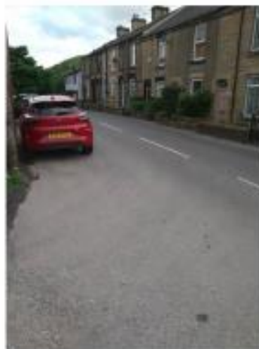
View from junction looking south taken from passenger seat and on foot - parked cars obscuring view to south.