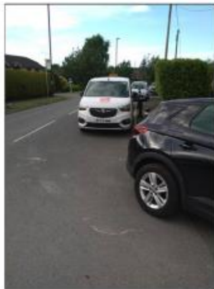
Typical position at mouth of junction looking north up Under Lane - parked cars obscuring view.