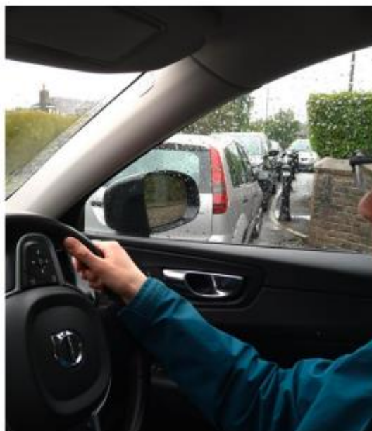
Car stopped at mouth of junction photo facing north (taken from passenger seat) – parked cars obscuring view down Under Lane